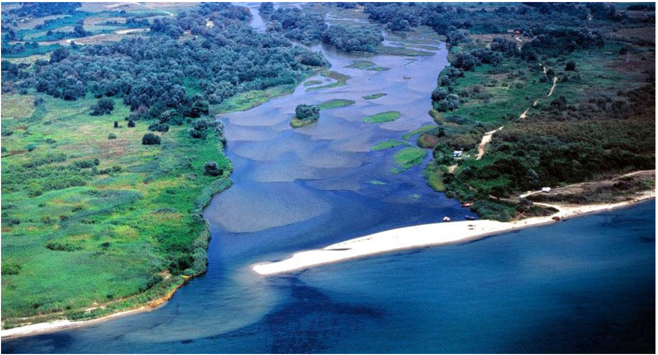
Delta, river Nestos

The National Confederation of Disabled People (N.C.D.P. - PB5), is the umbrella organization representing the disability movement of Greece. N.C.D.P. was founded in 1989, as a non-profit legal entity, by organizations of people with disabilities and their families in order to cope with issues of common interest related to any kind of disability and therefore, is a strong, independent representative body for all disabled people in the Greek state. Today, N.C.D.P. has more than 450 member-organizations that deal with all kinds of disabilities. The N.C.D.P.'s mission is to combat discrimination against people with disabilities and protect their constitutional and human rights as well as the rights of their families. Its goal is the equalization of opportunities for people with disabilities in all areas of life, including the area of employment. Over the last years the N.C.D.P. has been working very hard for the implementation of the provisions of the United Nations Convention on the Rights of Persons with Disabilities (UNCRPD), which was ratified by the Greek State in 2012 (Greek Law 4074/2012). The N.C.D.P. is a founding member of the European Disability Forum (E.D.F), which is the umbrella organization of persons