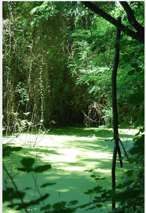
River Nestos, Mun. of Nestos

The protected areas cover about 40% of the territory which RIEW – Blagoevgrad is responsible for. Management activities are oriented towards clear and tangible benefits for nature and local population.