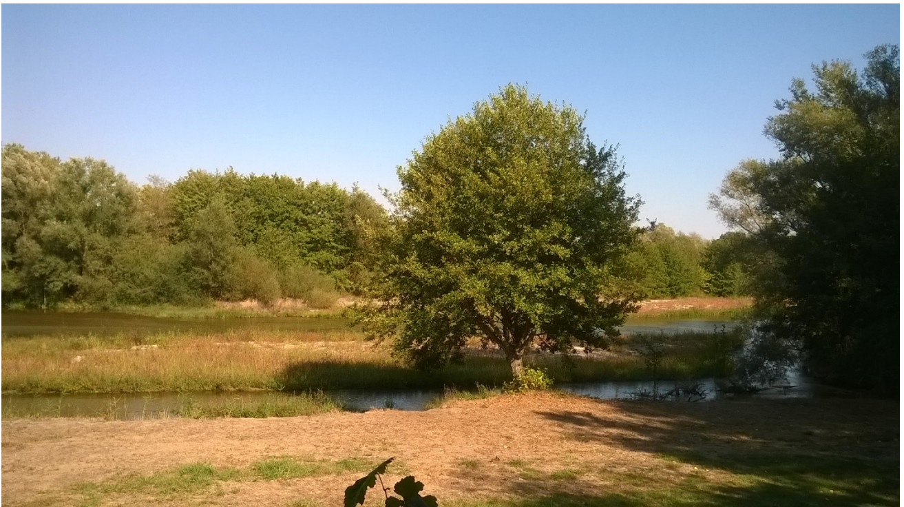
River Nestos