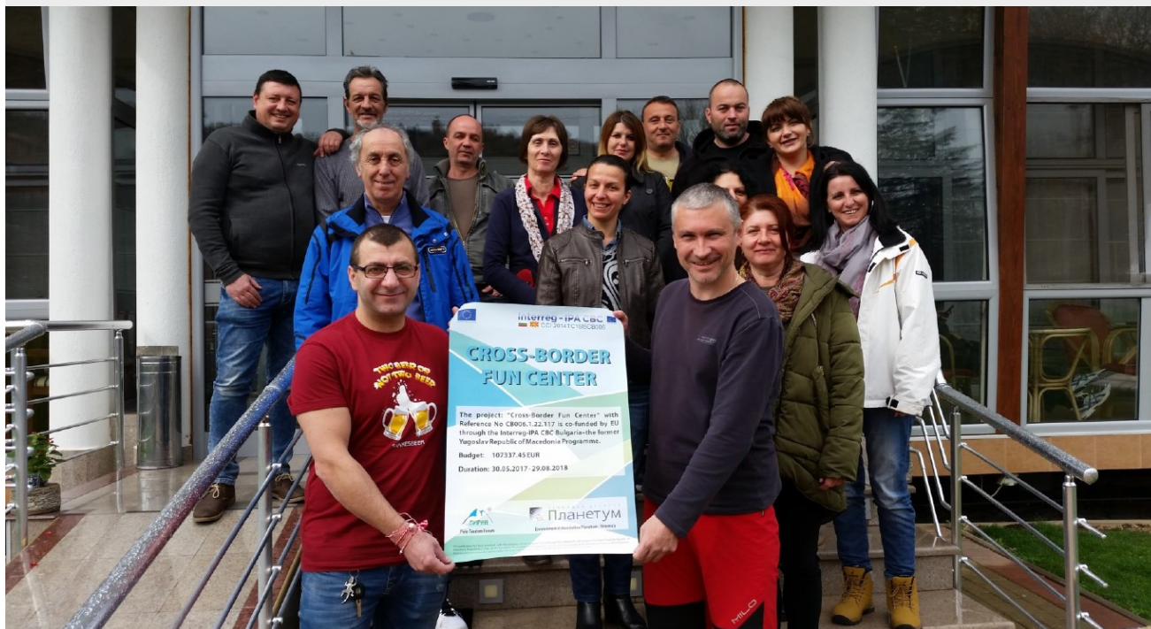
CBFC Project Meeting March

www.crossborderfuncenter.net, an array of modern and attractive tourism services based on heritage interpretation.