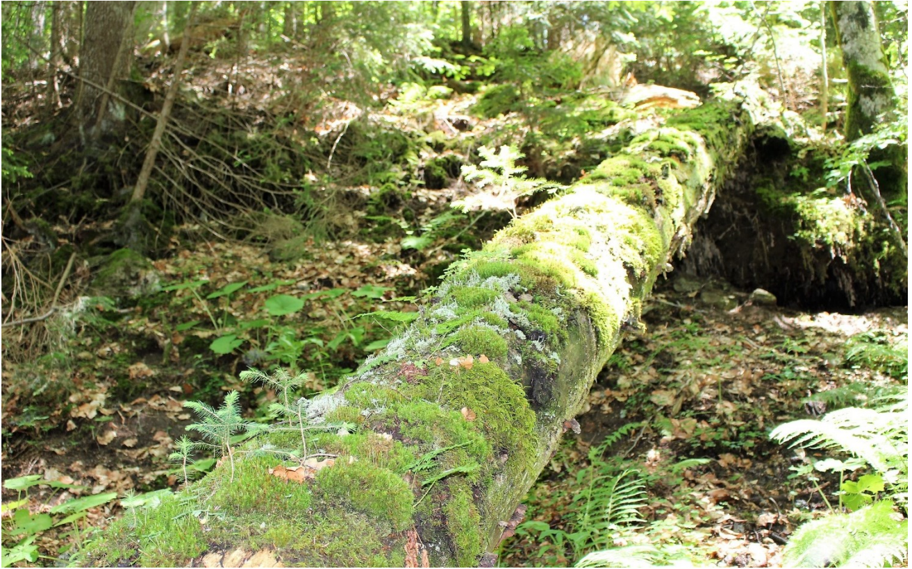
The Parangalitsa