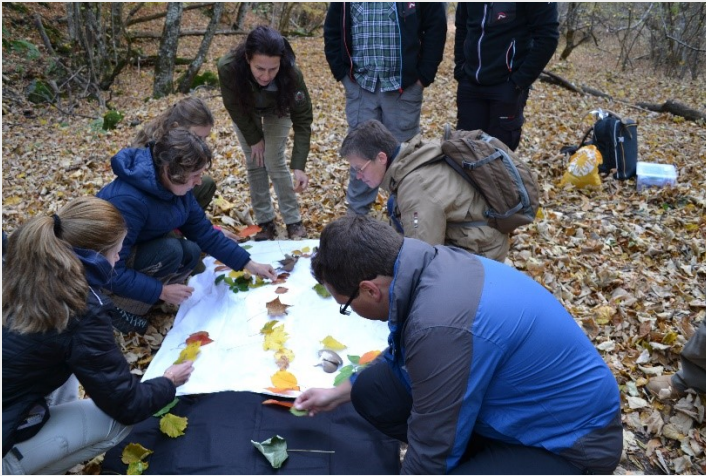
Training of Nature Guides

The PTF, PB9, has just started a new project funded by the German Federal Foundation for the Environment (DBU), with the participation of two German partners: the small environmental communications company Terolog and BTE – a consulting association in the field of sustainable tourism.