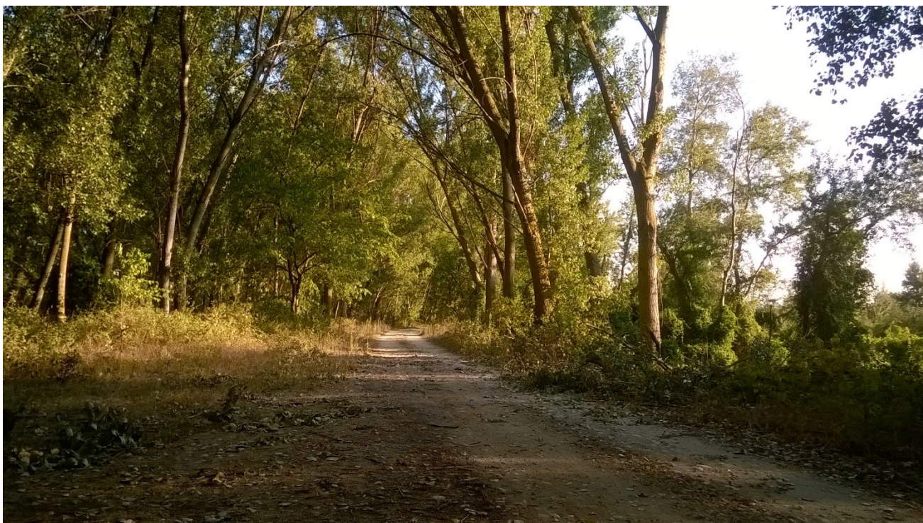
Riparian forest, river Nestos