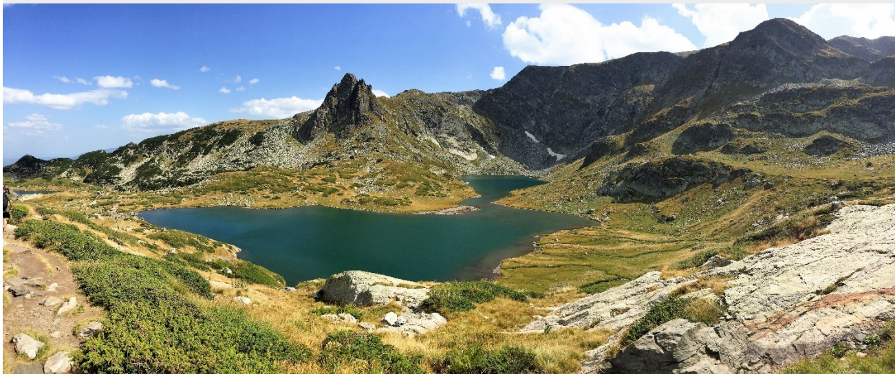
The seven Rila lakes

feedback DSS. Lessons learned during BIO2CARE implementation and scientific results from studies will form the D.7 output, to be discussed during last quarter of project with local, regional and national authorities.