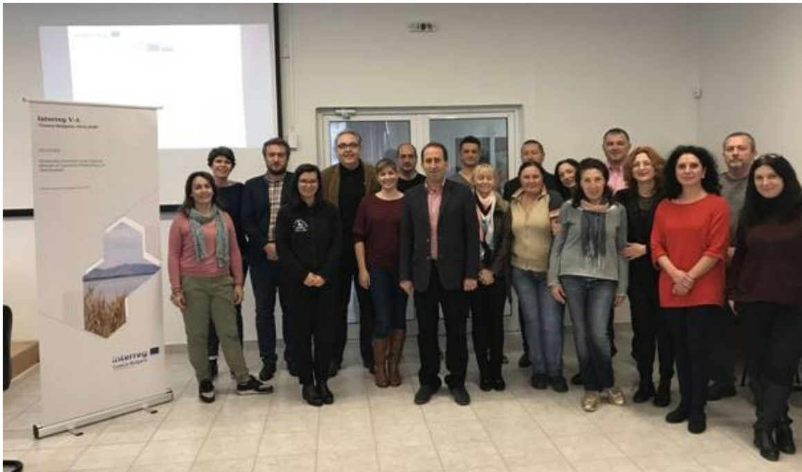
The BIO2CARE team with the Mayor of the Municipality of Nestos during the Kick-off meeting