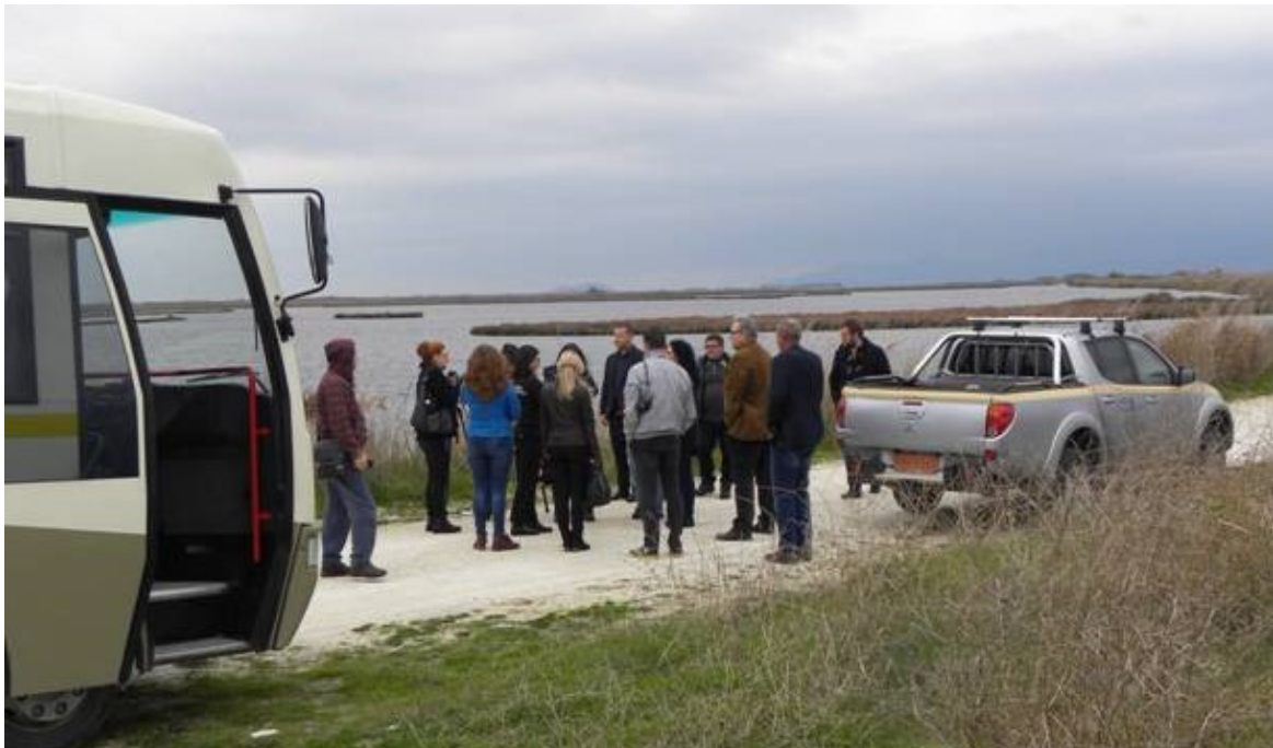
The Kick-off meeting ended up with a Team-Building field trip where partners had the opportunity to visit the Delta of Nestos Information Center located in Keramoti, enjoy the natural habitat of the National Park of Eastern Macedonia and Thrace and go bird-watching