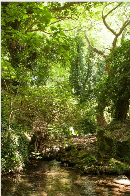
River Nestos, Mun. of Nestos

Project co-funded by the European Union and National funds of the participating countries